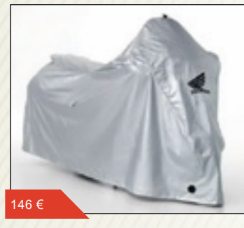
Manufactured from water-resistant and breathable fabric, allowing bike to dry naturally while covered. Protects paint against damaging U.V. rays and features a securing rope plus access to fit U-lock.