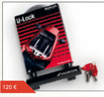
Constructed with tamper-resistant barrel. Fits neatly under the seat while not in use.