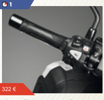
Slim-profile heated grips featuring integrated control with three settings, 'smart' heat allocation that focuses on the hand area most cold-sensitive and battery-drain protection. Heated grips attachment (08T70-MJL-D70) is required to fit this accessory. Special heat-resistant glue (08CRD-HGC-20GHE) is also available.