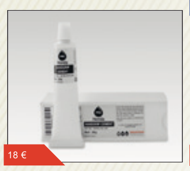
Special heat-resistant glue; recommended for easy and secure installation of heated grips.