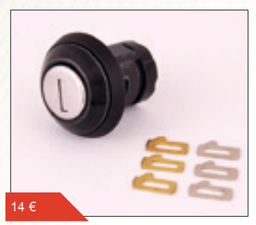
Required for 35L top box; cylinder body kit for 1-key operation. To be combined with cylinder inner kit (08885-HAC-P00).