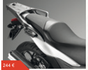
4-piece painted pannier supports bolt onto the pillion step bracket and pannier stay. Pannier stay kit (08L74-MGS-J30) is required to fit this accessory.