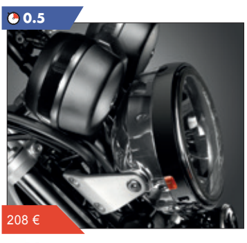
Chromed headlight surround adds stylish detail.