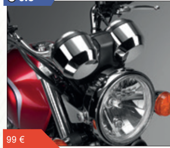
Chrome covers for speedometer and tachometer add to the classic style.