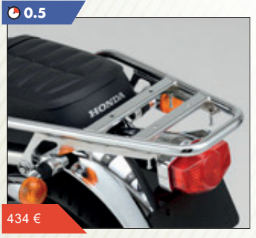
Chromed tubular steel rear carrier for CB1100 and CB1100 EX.