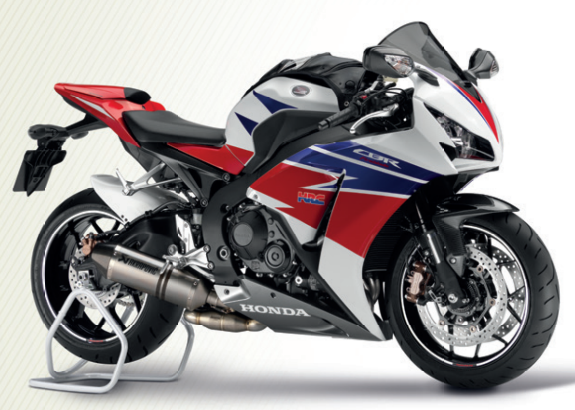
AKRAPOVIC SLIP-ON EXHAUST