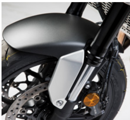
Front Fender Panel Kit* 08F79-MKJ-D00

By measuring the intensity of the shifting input, the quick shifter enables the rider to change gear without the need to operate the clutch lever or shut the throttle. The system aids upshifting and downshifting, maximizing the riding experience. € 787.00