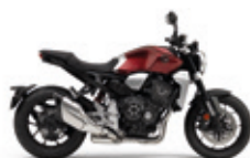
Candy Chromosphere Red