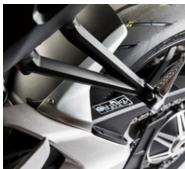
Rear Fender Panel* 08F78-MKJ-D00

Seat cowl matching the colour of the bike, fitted with a high quality aluminium panel. To be installed instead of the passenger seat. 3 colours available: • Candy Chromosphere Red (08F80-MKJ-D00ZA) • Mat Bullet Silver (08F80-MKJ-D00ZB) • Graphite Black (08F80-MKJ-D00ZC) € 258.00