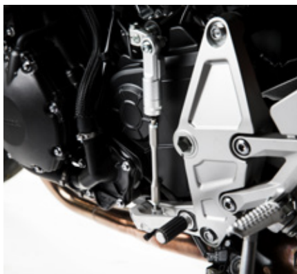
Quick Shifter* 08U70-MKJ-D00

By measuring the intensity of the shifting input, the quick shifter enables the rider to change gear without the need to operate the clutch lever or shut the throttle. The system aids upshifting and downshifting, maximizing the riding experience. € 787.00