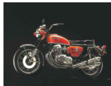
The Dream CB750 FOUR, which hit the market in July 1969

After 5 consecutive titles in the World Grand Prix Road Racing Series, Honda decided to withdraw and turn toward its primary target: transfer the technology obtained in competition to develop high-performance consumer machines. After a first attempt with a 450cc, Honda released the CB750 Four in January 1969. The initial production forecast of 1,500 units a year became soon a monthly figure and then jumped to 3,000 units/month. By pushing the boundaries of performance, reliability and easy handling in motorcycles, Honda created a new class of Superbikes. The CB1000R is the modern expression of the same spirit that guides Honda engineers since decades.