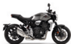
Mat Bullet Silver Metallic