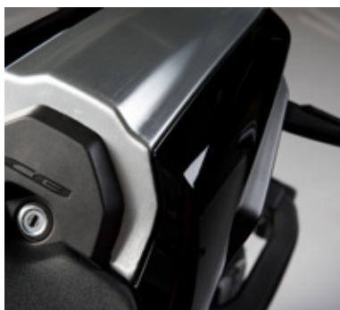
Single Seat Cowl* 08F80-MKJ-D00ZC

Meter visor fitted with a high quality aluminium panel to enhance the iconic look of the CB1000R. € 242.00