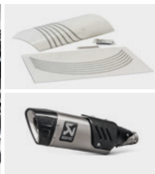
Wheel Stripe Kit 08F74-MKJ-D00ZA

High quality aluminium panel that will underline the shape of hugger for a total Neo Retro look. € 203.00