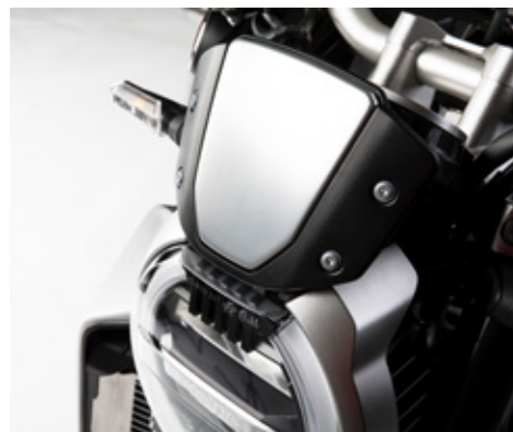
Meter Visor* 08R72-MKJ-D00

High quality aluminium panel to add to the front fender of the CB1000R. € 232.00