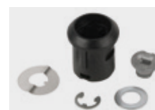
Key Body Part 08M71-MJE-D01

Key body part for one key system (wave key) Allows the pannier or topbox to be used with the bike's ignition key. One set required per pannier or topbox.