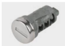
Key Cylinder Inner Set 08M70-MJE-D03

Cylinder inner set for one key system (wave key) Allows the pannier or topbox to be used with the bike's ignition key. One set required per pannier or topbox.