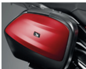
29L Panniers Set 08ESY-MKD-PA17

Pack including 2 specially designed, aerodynamic and fully integrated 29L panniers, with one key system, rear carrier, support and the requested components to install the one key system.