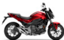
Candy Chromosphere Red