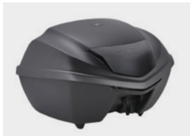
35L Top box 08L72-MJE-D00ZA

35L Top box designed for one key system Must be combined with: