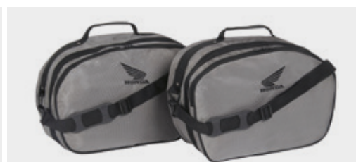
Inner Bags for 29L Pannier set 08L79-MGS-J30

Set of 2 strong, light grey, nylon-fabric pannier inner bags. 16l of carrying capacity each, front pocket included. Handle and straps for easy carrying. Black embroidered Honda logo on the front pocket.