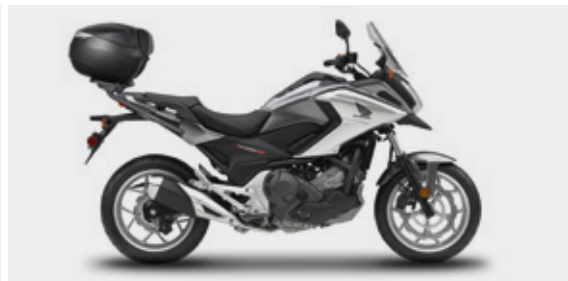
39L Top Box with Back Rest 08L39-MKA-RTB

39L Top Box with backrest, delivered with every components needed for mounting (plate, rear carrier) or to lock it with using the bike key.