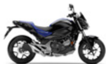
Graphite Black / Blue Metallic