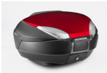
48L Top Box with Back Rest 08L48-MKA-RTB

48L Top Box with backrest, delivered with every components needed for mounting (plate, rear carrier) or to lock it with using the bike key.