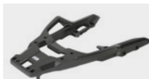
Rear Carrier 08L70-MKA-D80

Rear carrier specifically designed for the NC750S to install the 35L top box and the 29L panniers