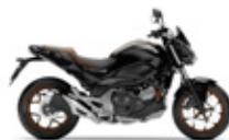
Graphite Black / Pearl Brown