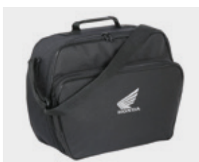
Inner Bag for 35L Top Box 08L09-MGS-D30

Black nylon bag with silver Honda logo on front pocket. Expandable from 15 to 25l. Front pocket can contain an A4-size file. Comes with adjustable shoulder belt and carrying handle.