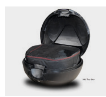
39L Top Box / 39L Inner Bag for RTB 08L39-MJW-RTB / 08L39-RTB-INNER