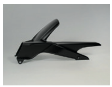
Rear Hugger 08F70-MGZ-J00 This hugger protects the rear shock from dirt and road salt. Features an integrated chain guard.