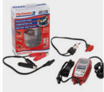
Honda Optimate 5 Battery Optimizer for EU market (801E) or UK market (801U) 08M51-EWA-801U 08M51-EWA-801U

Suitable for all types of 12V lead-acid batteries of rated capacity from 3 to 50Ah. Effective on very neglected batteries from as low as 2 Volts. No risk of overcharging. Ensured safety for vehicle electronics.