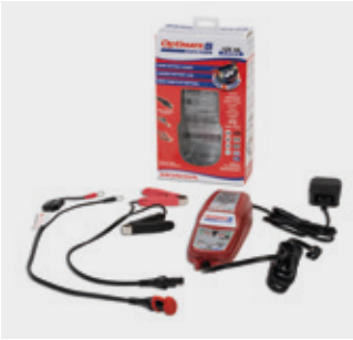
Honda Optimate 3 for EU market (601E) or UK market (601U) 08M51-EWA-601E/08M51-EWA-601U

For more secure parking on variable ground surfaces. Facilitates bike cleaning and rear wheel maintenance.