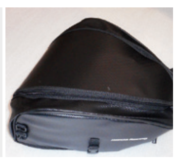
Seat Bag / Seat Bag Attachment 08L56-MGM-800A / 08L71-MJW-J00

Required to fix the seat bag to the unit carrier. €59.00/€63.00