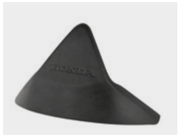
Moulded Tank Pad 08P71-MJW-J00 Sturdy pad for maximum tank protection.