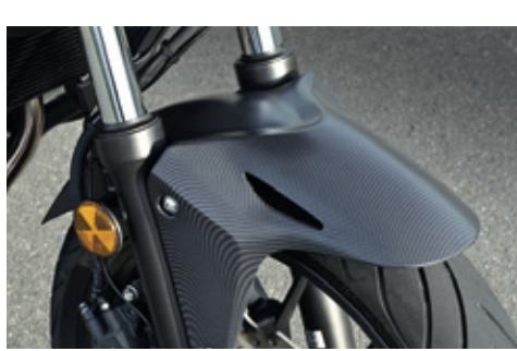
Carbon Look Front Fender 08F85-MGZJ00

Replacement front mudguard. Gives the bike a more focused look. € 85.00