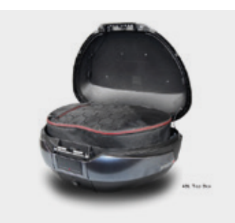
48L Top Box / 48L Inner Bag for RTB 08L48-MJW-RTB / 08L48-RTB-INNER