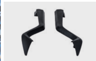
Deflector Kit 08R70-MKK-D20

This set of deflectors channels better the air flows around the bike and improves the rider comfort.