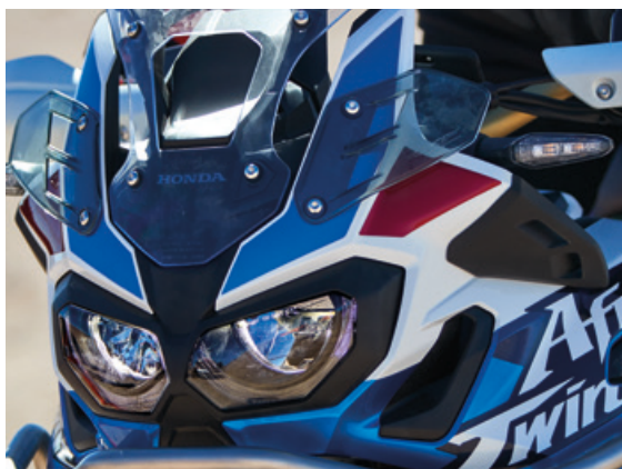
Visor Kit 08R71-MKK-D00

This set includes a pair of adjustable, bright white LED Front Fog Lights and all components necessary for their installation. Increase the visibility for the riders and make them more noticeable for the surrounding traffic.