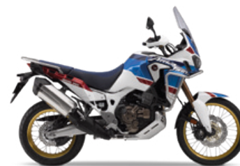
Pearl Glare White Tricolour