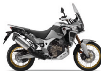
Digital Silver Metallic

Perfect combination of accessories with special prices.