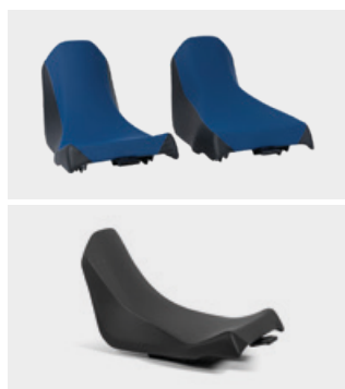
Middle Seat / Low Seat 08R71-MKK-D20ZD, 08R72-MKK-D20ZB or 08R70-MKK-DW0ZC

Made of aluminium and rubber covered, these wider pegs limit the vibrations experienced by the pillion.