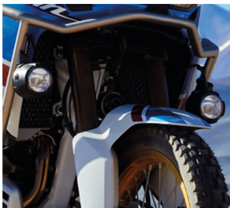
Easy Fog Light Kit 08ESY-MKK-FL18

This set includes a pair of adjustable, bright white LED Front Fog Lights and all components necessary for their installation. Increase the visibility for the riders and make them more noticeable for the surrounding traffic.