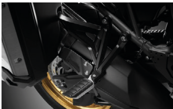
High comfort pillion steps 08R71-MJP-G50

This set of deflectors channels better the air flows around the bike and improves the rider comfort.