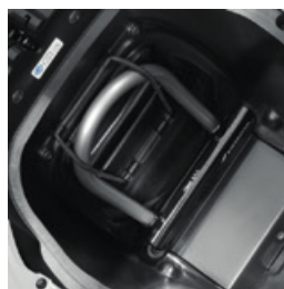
U-Lock 123/217 08M53-MEE-800

Facilitates cleaning and rear wheel maintenance plus allows for more secure parking on uneven surfaces.