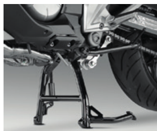
Main Stand Kit 08M70-MGS-D30

Facilitates cleaning and rear wheel maintenance plus allows for more secure parking on uneven surfaces.