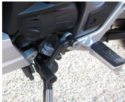
DCT Foot Shift Kit 08U70-MGS-D51

Delivering great looks and increased performance, this street legal Slip-on Exhaust features laser engraved Akrapovič logo, and conforms to all exhaust system noise level regulations for street use.