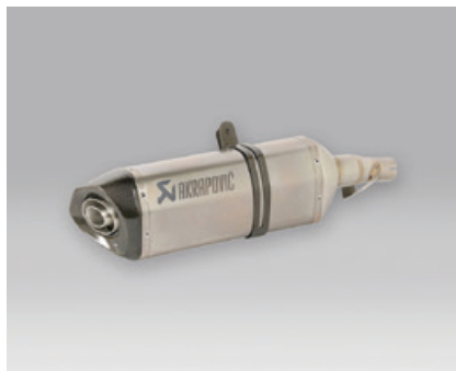
Akrapovič Titanium Slip-On Exhaust 08F88-MKA-900

Delivering great looks and increased performance, this street legal Slip-on Exhaust features laser engraved Akrapovič logo, and conforms to all exhaust system noise level regulations for street use.