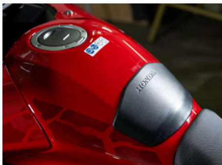
Tank Pad 08P70-MGH-J20

Improve the protection and gives a mounting for the fog lights (sold separately)