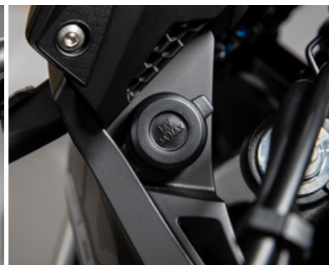
12V Socket 08U70-MKP-D80

Extremely slim heated grips which provide 360° heat around the grips. Features integrated control for maximum rider comfort and design integration. Features 3-step variable heating levels, integrated circuit to protect the battery from draining and smart heat allocation that focuses on the area of the hands most sensitive to cold. Attachment and special heat-resistant cement are also included in this set.