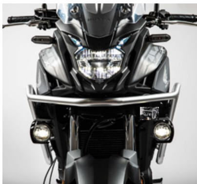
Fog Lights Set 08ESY-MKP-F0G19

Set of 2 additional front LED headlights with all necessary components for fitment to the front side pipe also included in this set. Increase the visibility for the rider and make him more noticeable for the traffic surrounding him.