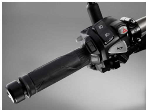
Grip Heaters Set 08ESY-MKP-HG19

Set of 2 additional front LED headlights with all necessary components for fitment to the front side pipe also included in this set. Increase the visibility for the rider and make him more noticeable for the traffic surrounding him.