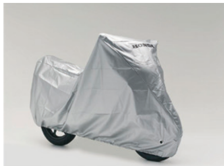
Outdoor cycle cover XL

Suitable for all types of 12V lead-acid batteries of rated capacity from 3 to 50Ah. Effective on very neglected batteries from as low as 2 Volts. No risk of overcharging. Ensured safety for vehicle electronics. 2 versions available (EU or UK market)