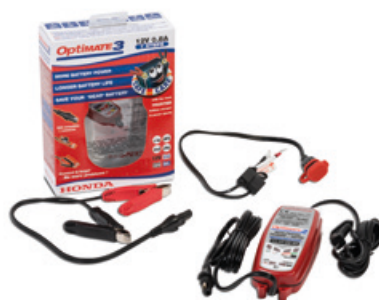
Honda Optimate 3

Facilitates cleaning and rear wheel maintenance, plus allows for more secure parking on uneven surfaces.