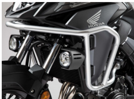
Front Side Pipe 08P72-MKP-J80ZA

Improve the protection and gives a mounting for the fog lights (sold separately)