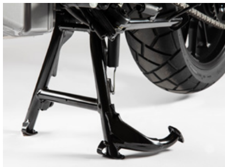
Main Stand Kit 08M70-MKP-J80

Facilitates cleaning and rear wheel maintenance, plus allows for more secure parking on uneven surfaces.