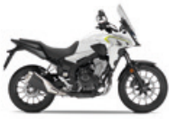
Pearl Metalloid White