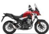
Grand Prix Red