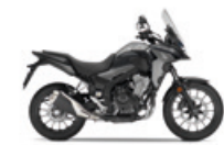
Mat Gunpowder Black Metallic