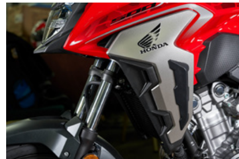
Deflector kit 08R71-MKP-J80

Smoked windscreen for improved comfort and a sporty look. Size and shape are identical to the standard clear wind screen.