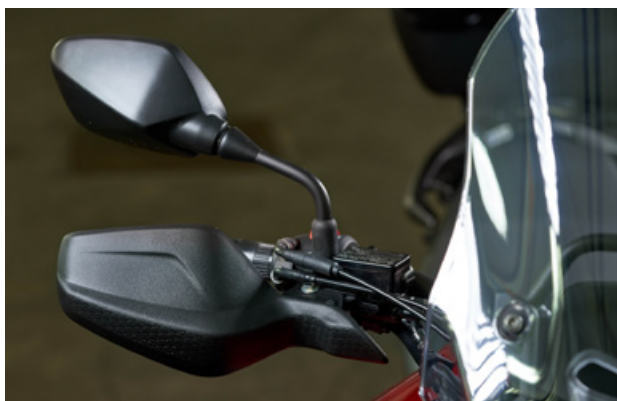
Knuckle Guards 08P70-MJV-J80

12V Power Socket allows you to power or charge electrical equipment directly from the bike.