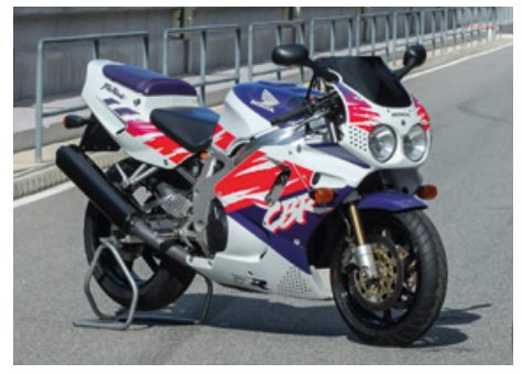
The CBR900RR Fireblade that started all.

Aiming to create a high-performance motorcycle that could defeat its own RVF750 in Endurance Road Races, Honda developed an R&D project that led directly to the CBR900RR, in 1992. With 128 HP, it was not the most powerful of its time. However, thanks to a dry weight of 185 kg when all rivals were well over 200 kg, the first Fireblade, soon nicknamed "Blade" by the fans, was so easy to control that it seemed to read its rider's mind. More than 25 years after, the most powerful and nimble Honda bikes keep carrying the Blade legacy.