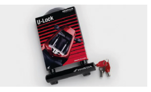
U-Lock 08M53-MFL-800 Keep your Fireblade safe with this tamper-resistant barrel key U-Lock that fits neadly under the seat.

High efficiency diagnostic charger and tester for Lithium batteries [LiFeP04/LFP]. Perfect to charge and maintain batteries sized from 2 to 100 Amp-hour. Program controlled by microprocessor. Fully sealed. Cables length : 2m (Input or Output cables). Wall mounts included.