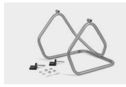
Rear maintenance stand 08M50-MW0-801 Tilting tubular steel stand that eases cleaning and rear wheel maintenance. Lifts the motorcycle by the end of its swingarm.