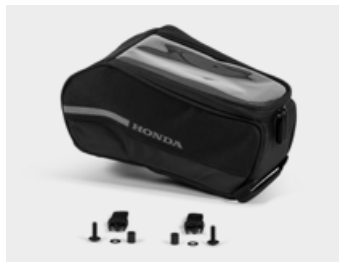
Tank bag set 08ESY-MKP-TKB19

A simple and functional tank bag adapted to the tank of the unit. Thanks to the specific attachment included, the stable mounting of the tank bag does not disturb the handling of this machine. Clear pocket on the top of the bag makes it possible for easy smart phone storage. Bag capacity is 3L and a rain cover is included. Dimensions in mm (W x L x H): 178 x 285 x 130