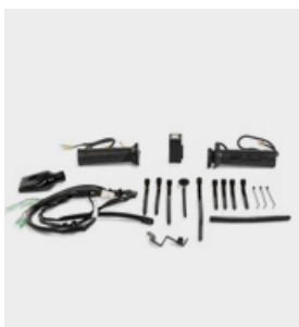
Heated grips set 08ESY-MJF-HG1617

The smoked wind screen improves the overall comfort of the bike by protecting the rider against the elements. It also adds to the appearance of the bike.