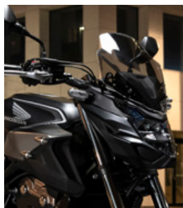
Wind screen kit (Smoke) 8R70-MKP-D40

The smoked wind screen improves the overall comfort of the bike by protecting the rider against the elements. It also adds to the appearance of the bike.