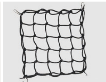
Cargo net 08L63-KAZ-011

Black nylon bag with silver Honda wing logo on front pocket. Expandable from 15 to 25L. Front pocket can contain an A4-size file. Comes with adjustable shoulder belt and carrying handle.