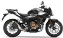
Mat Gunpowder Black Metallic