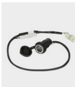
12V Accessory socket 08U70-MJW-J00

Extremely slim heated grips which provide 360° heat around the grips. Features integrated control for maximum rider comfort and design integration. Features 3-step variable heating levels, integrated circuit to protect the battery from draining and smart heat allocation that focuses on the area of the hands most sensitive to cold. Attachment included. Special heat-resistant glue available (sold separately).