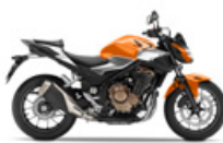
Candy Energy Orange