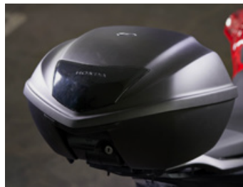
35L Top box Set 08ESY-MKP-TB19

A simple and functional tank bag adapted to the tank of the unit. Thanks to the specific attachment included, the stable mounting of the tank bag does not disturb the handling of this machine. Clear pocket on the top of the bag makes it possible for easy smart phone storage. Bag capacity is 3L and a rain cover is included. Dimensions in mm (W x L x H): 178 x 285 x 130