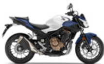
Pearl Metalloid White