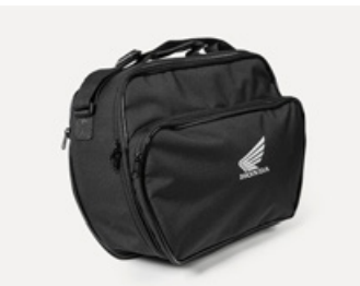
Top box inner bag (35L) 08L09-M6S-D30

Set including a 35L Top Box and all the components needed to install it on the bike (rear carrier and base). The key system provided make it usable the key of the unit. Inner bag included (08L09-M6S-D30).