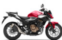
Grand Prix Red