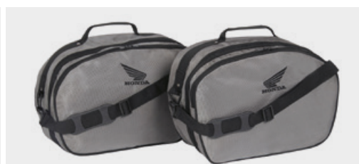
Inner Bags for 29L Pannier set 08L79-MGS-J30

Black nylon inner bag with stylish print, red colour zips and the Honda logo on its front. Front pocket that can contain A4 size file. Comes with adjustable shoulder belt and carrying handle. Black nylon inner bag with stylish print, red colour zips and the Honda logo on its front. Front pocket that can contain A4 size file. Comes with adjustable shoulder belt and carrying handle. 2 sizes available:- for 39L Top Box (08L39)- for 48L Top Box (08L48)