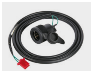
12V Accessory socket 08E70-MKA-D80

Heat resistant cement specifically designed for heated grips.