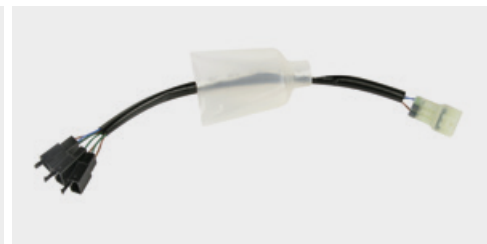
Sub harness 08A70-MJL-D30

This component is requested to power up Heated Grips and/or Navi attachment kit and/or Averta alarm.