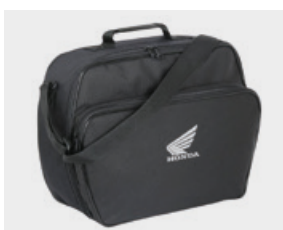
Inner Bag for 35L Top Box 08L09-MGS-D30

Pack including 2 specially designed, aerodynamic and fully integrated 29L panniers, with one key system, rear carrier, support and the requested components to install the one key system.