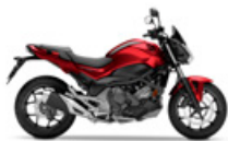
Candy Chromosphere Red