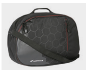
Inner Bag (*) 08L39-RTB-INNER / 08L48-RTB-INNER

Black nylon bag with silver Honda logo on front pocket. Expandable from 15 to 25L. Front pocket can contain an A4-size file. Comes with adjustable shoulder belt and carrying handle.