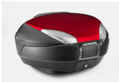
48L Top Box (*) 08L48-MKA-RTB, RTBA, C, E or G

48L Top Box with backrest, delivered with every components needed for mounting (plate, rear carrier) or to lock it with using the bike key.