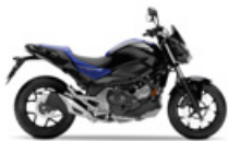
Graphite Black / Blue Metallic