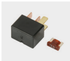
Relay kit 08A70-MGS-D30

To power up your electronic devices. Must be combined with sub harness (08A70MJLD30) and/or relay set (08A70MGSD30) sold separately. Ask your local Honda dealer for advice regarding these technical components.