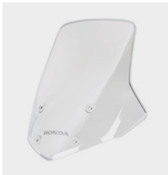
High screen 08R72-MGS-D10

Stylish PC fly screen*Provides relief from blasts on the chest at high speeds*50mm higher and 40mm wider than the factory std screen