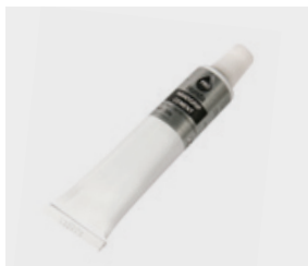
Hand Grip Cement 08CRD-HGC-20GHE

Heat resistant cement specifically designed for heated grips.