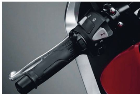
Easy Heated Grips Pack 08ESY-MJS-HG17M or 17DCT

Stylish PC fly screen*Provides relief from blasts on the chest at high speeds*50mm higher and 40mm wider than the factory std screen