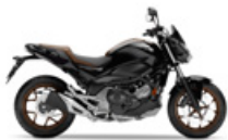
Graphite Black / Pearl Brown