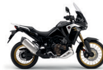
Digital Black Metallic

Perfect combination of accessories with special prices.