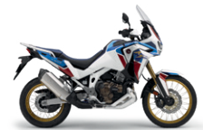
Pearl Glare White Tricolor