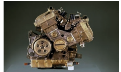
The first Honda V4 engine developed in 1978 for the Road Racing World Championship

The love story between Honda and the V4 4-Stroke DOHC engines started 40 years ago. Designed to challenge the 2 strokes dominating the Road Racing World Championship, the NR500 started the lineage of Honda bikes sharing the DNA rooted in the Crossrunner: the unique flexibility, smoothness and purity of output provided by a V4 engine.