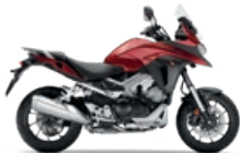
Candy Prominence Red