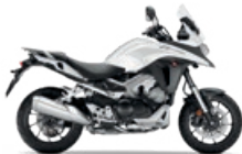
Pearl Glare White