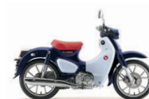
Pearl Niltava Blue

Chrome plated High-quality Rear Carrier provides secure additional storage space.