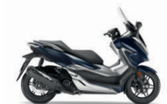
Crescent Blue Metallic