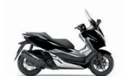
Pearl Nightstar Black