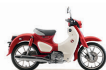
Pearl Nebula Red