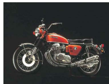
The Dream CB750 FOUR, which hit the market in July 1969

After 5 consecutive titles in the World Grand Prix Road Racing Series, Honda decided to withdraw and turn toward its primary target: transfer the technology obtained in competition to develop high-performance consumer machines. After a first attempt with a 450cc, Honda released the CB750 Four in January 1969. The initial production forecast of 1,500 units a year became soon a monthly figure and then jumped to 3,000 units/month. By pushing the boundaries of performance, reliability and easy handling in motorcycles, Honda created a new class of Superbikes. The CB1000R is the modern expression of the same spirit that guides Honda engineers since decades.