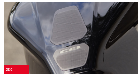
Tank pad kit (CB logo) 08P71-MKN-D50

Tank pad featuring the CB logo. The tank pad helps to protect the tank paintwork from scratches.