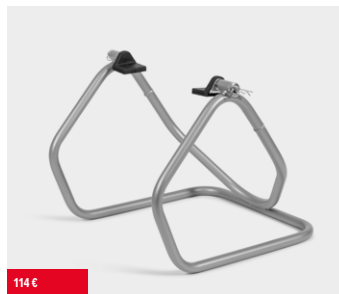
Rear maintenance stand 08M50-MW0-801

Suitable for all types of 12V lead-acid batteries of rated capacity from 3 to 50Ah. Effective on very neglected batteries from as low as 2 Volts. No risk of overcharging. Ensured safety for vehicle electronics. 2 versions available (EU or UK market)