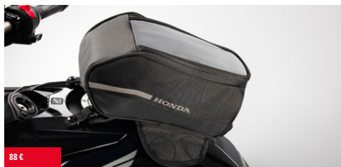
Tank bag set 08ESY-MKJ-TKB18

A simple and functional tank bag adapted to the tank of the unit. Thanks to the specific attachment included, the stable mounting of the tank bag does not disturb the handling of this machine. A clear pocket on the top of the bag makes it possible for easy smart phone storage.