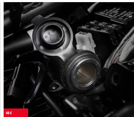
12V Accessory Socket 08U70-MKN-D50

Pair of left and right stays required to install either the front visor or the meter visor (sold separately).