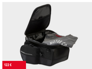
Rear Seat Bag Set 08ESY-MKJ-STB18

Bag capacity: 3L Rain cover included. Dimensions (W x L x H): 178 x 285 x 130