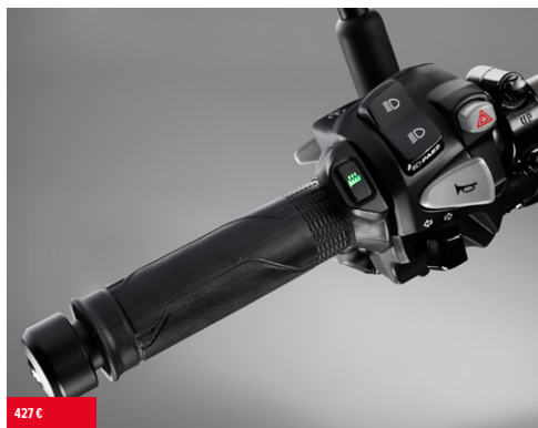
Easy grip heat pack 08ESY-MKN-HG19

Extremely slim heated grips which provide 360° heat around the grips. Features integrated control for maximum rider comfort and design integration. Features 3-step variable heating levels, integrated circuit to protect the battery from draining and smart heat allocation that focuses on the area of the hands most sensitive to cold. Attachment and Honda High-Temperature special cement included.