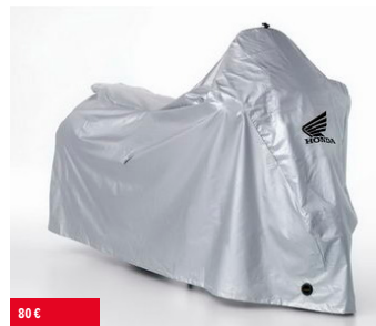
Outdoor cycle cover XL 08P34-BC2-801

Tilting tubular steel stand that facilitates cleaning and rear wheel maintenance. Lifts the motorcycle by the end of its swingarm.