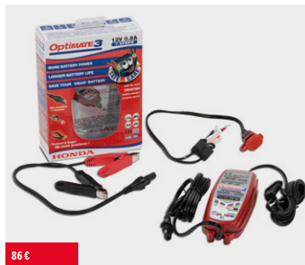
Honda Optimate 3 08M51-EWA-601E or 601U

Suitable for all types of 12V lead-acid batteries of rated capacity from 3 to 50Ah. Effective on very neglected batteries from as low as 2 Volts. No risk of overcharging. Ensured safety for vehicle electronics. 2 versions available (EU or UK market)