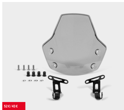
Front Visor (Smoke) 08R71-MKN-D50 Fitted to the meter panel, this small and stylish wind deflector protects the chest from wind blasts at higher speeds. Stays are sold separately (08R74-MKN-D50).

Extremely slim heated grips which provide 360° heat around the grips. Features integrated control for maximum rider comfort and design integration. Features 3-step variable heating levels, integrated circuit to protect the battery from draining and smart heat allocation that focuses on the area of the hands most sensitive to cold. Attachment and Honda High-Temperature special cement included.