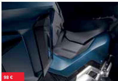
UPPER DEFLECTOR 08R72-MKV-D00

The 5 temperature levels of these slim heated grips are displayed on the TFT monitor. When the ignition is switched off, the last position is memorized. An integrated circuit protects the battery from draining.