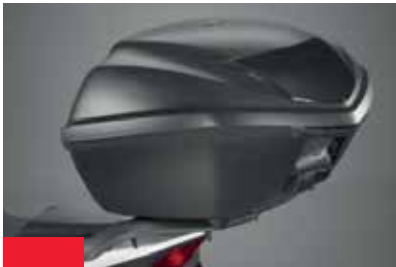
35L TOP BOX KIT 08ESY-K1Z-35TB 35-litres plastic Top Box with a backrest that can store 1 helmet. Top box base and key system included.