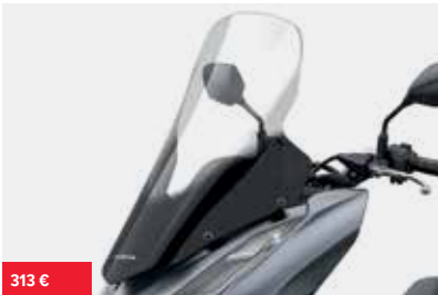
WINDSCREEN 08R70-K1Y-D10 The Windscreen improves the comfort of the rider and adds the final touch to the design of the PCX125.