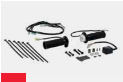
GRIP HEATERS KIT 08ESY-K1Z-GRIP Extremely slim heated grips with integrated control to maximize the rider comfort. Feature 3 variable heating levels and an integrated circuit to protect the battery from draining. Kit containing the Grip Heaters, the Attachment and the Honda High-Temperature cement.