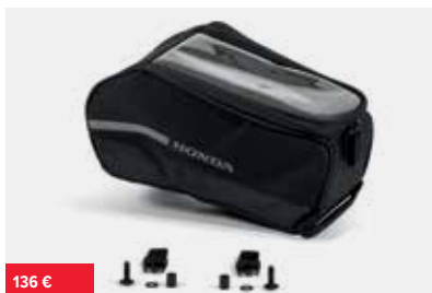
TANK BAG SET 08ESY-MKP-TKB19

A simple and functional tank bag adapted to the tank of the unit. Thanks to the specific attachment included, the stable mounting of the tank bag does not disturb the handling of this machine. Clear pocket on the top of the bag makes it possible for easy smart phone storage. Bag capacity is 3L and a rain cover is included.