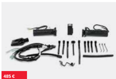
GRIP HEATERS 08ESY-MJF-HG1617

The smoked wind screen improves the overall comfort of the bike by protecting the rider against the elements. It also adds to the appearance of the bike.