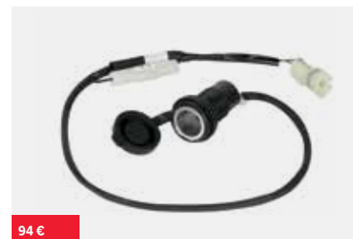
12V ACCESSORY SOCKET 08U70-MJW-J00

Extremely slim heated grips which provide 360° heat around the grips. Features integrated control for maximum rider comfort and design integration. Features 3-step variable heating levels, integrated circuit to protect the battery from draining and smart heat allocation that focuses on the area of the hands most sensitive to cold. Attachment included. Special heat-resistant glue available (sold separately).