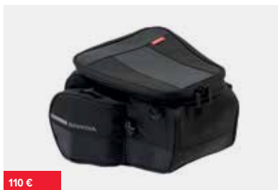
REAR SEAT BAG 08ESY-MKP-RRSEAT

Dimensions in mm (W x L x H): 178 x 285 x 130