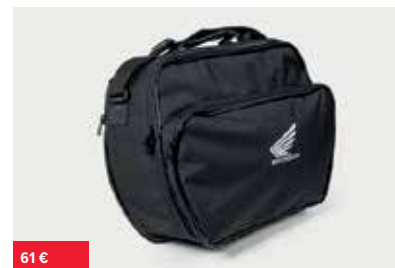
TOP BOX INNER BAG (35L) 08L09-MGS-D30

Functional rear seat bag with rain covers providing a capacity of 15L that can be expanded to 22L. Easy to attach and perfectly stable thanks to the specific attachment included.