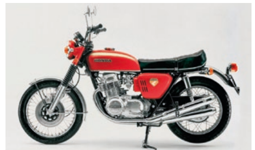
The Dream CB750 FOUR, which hit the market in July 1969

After 5 consecutive titles in the World Grand Prix Road Racing Series, Honda decided to withdraw and turn toward its primary target: transfer the technology obtained in competition to develop high-performance consumer machines. After a first attempt with a 450cc, Honda released the CB750 Four in January 1969. The initial production forecast of 1,500 units a year became soon a monthly figure and then jumped to 3,000 units/month. By pushing the boundaries of performance, reliability and easy handling in motorcycles, Honda created a new class of Superbikes. The CB1000R is the modern expression of the same spirit that guides Honda engineers since decades.