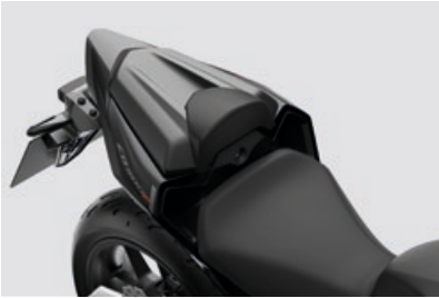
SEAT COWL 08F76-MJW-J00ZF

Custom shaped, colour-matching rear Seat Cowl that replaces the standard passenger seat for a sportier look. 224 €