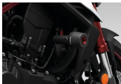
SKID PAD 08P70-MLB-D00

The skid pad, featuring the Honda logo, reduces damage of the fairing in case of a fall.