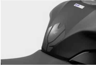
TANK PAD 08P61-KYJ-800 This Carbon fiber effect looking Tank Pad helps in protecting the paintwork from scratches and rubbing. 23 €