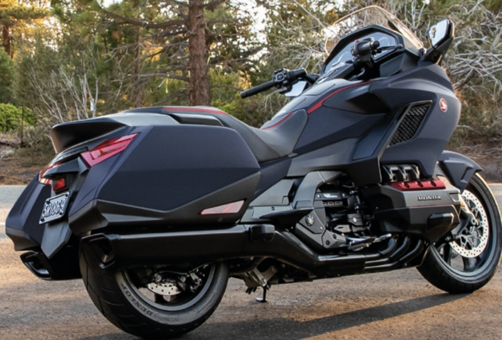
22YM Location Photos