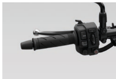
GRIP HEATER 08T70-MLB-D00

Extremely slim heated grips controlled by a simple operation of the integrated handle switch and displayed on the bike's TFT screen. Features 5 variable heating levels, integrated circuit to protect the battery from draining and memory function.