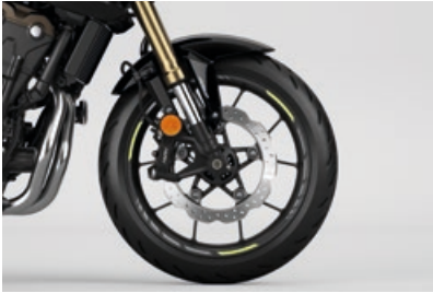
WHEEL STRIPES KIT 08F72-MKP-J40ZD / 08F72-MKP-J40ZE / 08F72-MKP-J40ZG / 08F72-MKP-J40ZH / 08F72-MKP-J40ZJ Enhance the sportiness of the CB500F with this easy to apply stripes kit. One kit per wheel is needed. 5 colours available: • Lemon Ice Yellow (shown) 08F72-MKP-J40ZD • Indi Grey Metallic 08F72-MKP-J40ZE • Pearl Metalloid White 08F72-MKP-J40ZG • Mat Crypton Silver 08F72-MKP-J40ZH • Seal Silver Metallic 08F72-MKP-J40ZJ 23 €

Custom shaped, colour-matching rear Seat Cowl that replaces the standard passenger seat for a sportier look. 224 €