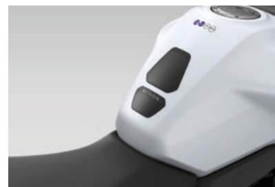
TANK PAD 08P70-MGC-J00

The tank pad, featuring the Honda logo, is exclusively designed to fit the tank shape, protecting it from scratches.