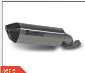
AKRAPOVIC SLIP ON 08F88-MJM-900

12V DC socket for powering additional electrical equipment.