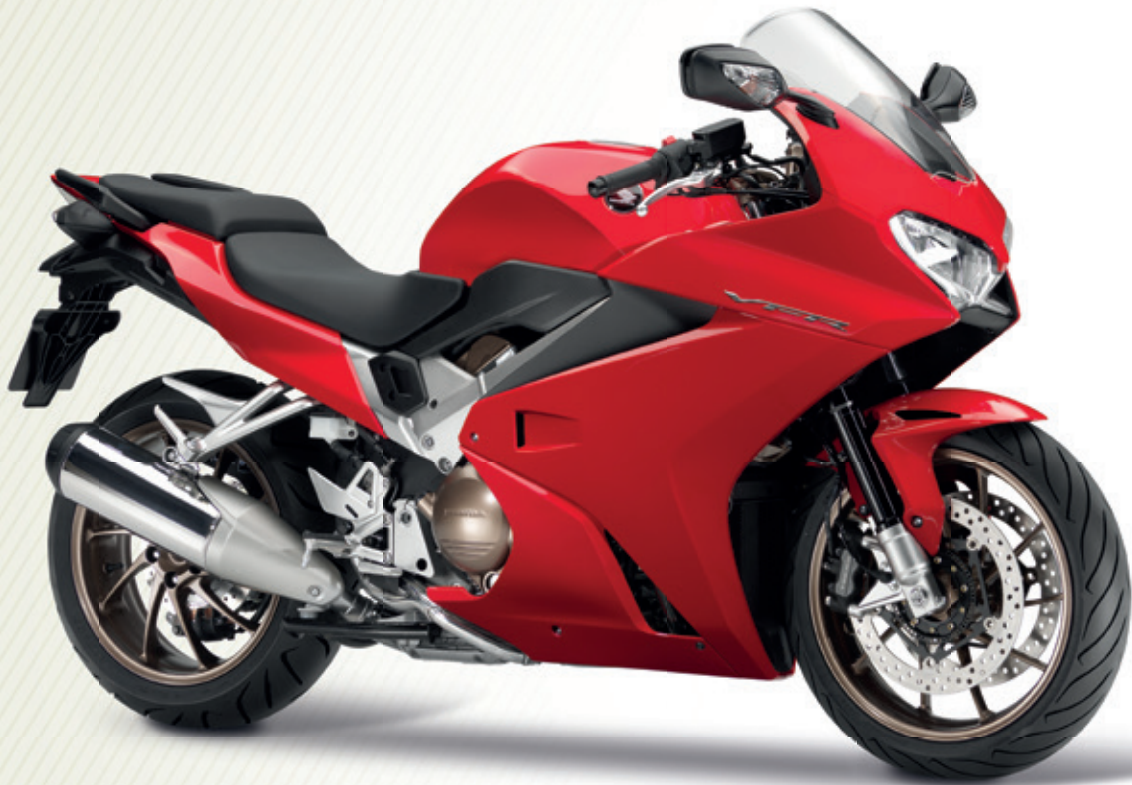
12V SOCKET 08U70-MJM-D00