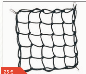
CARGO NET 08L63-KAZ-011

Titanium outer sleeve Akrapovic slip-on exhaust, street legal with E1 and TUV approval; can be used with panniers.