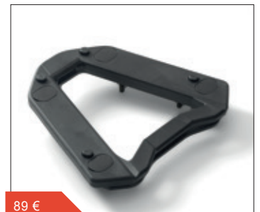
CARRIER BRACKET 31L 08L74-MJM-D10

Black elasticated webbing for securing luggage on rear seat/rack.