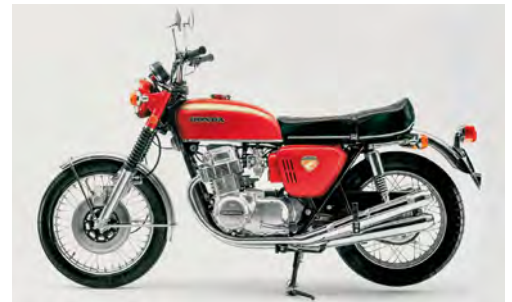
The Dream CB750 FOUR, which hit the market in July 1969

After 5 consecutive titles in the World Grand Prix Road Racing Series, Honda decided to withdraw and turn toward its primary target: transfer the technology obtained in competition to develop high-performance consumer machines. After a first attempt with a 450cc, Honda released the CB750 Four in January 1969. The initial production forecast of 1,500 units a year became soon a monthly figure and then jumped to 3,000 units/month. By pushing the boundaries of performance, reliability and easy handling in motorcycles, Honda created a new class of Superbikes. The CB1000R is the modern expression of the same spirit that guides Honda engineers since decades.