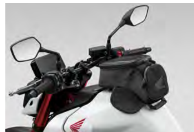
3L TANK BAG 08LB9-MKS-E00

This light and compact Tank Bag features a transparent pocket and it's ideal to store small personal items. Unnoticeable while steering the bike, this Tank Bag is firmly attached thanks to a one-touch buckle and a magnet. A rain cover is included.