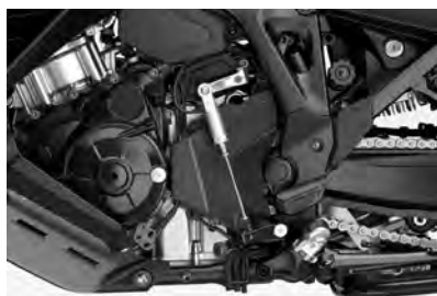
QUICK SHIFTER 08U70-MLF-E00