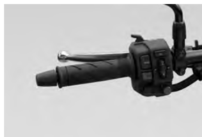
GRIP HEATER 08T70-MLB-D00