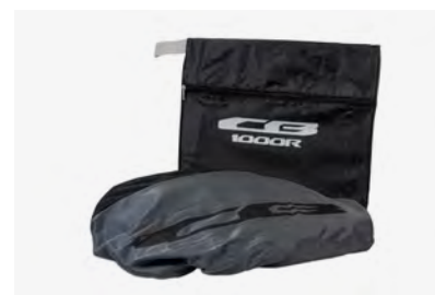
INDOOR BODY COVER 08P70-MKJ-D00

This Tank Pad featuring the CB logo helps to protect the Tank paintwork from scratches and rubbing.