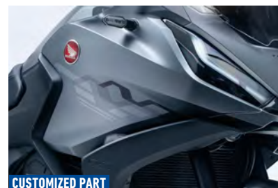
DECORATIVE STICKER SET 0R24M-NAD-011

With its black anodized treatment and the inclusion of the Honda logo, this Aluminium Parking Lever Cover elevates your bike's aesthetics, adding an exclusive and stylish touch to its design.