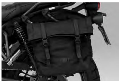
LEFT SADDLE BAG 08L05-K87-A31

Black nylon bag with embroidered silver Honda wing logo on the top, with red zippers. Expandable from 15 to 25L. Comes with adjustable shoulder belt and carrying handles.