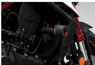
SKID PAD 08P70-MLB-D00