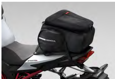
REAR SEAT BAG 08ESY-MLB-RRSEAT

A simple and functional rear bag specifically adapted to the tapered shape of the rear seat. Easy attachment and stable mounting is possible when installed with the rear seat bag attachment, and a rain cover is included for added practicality. Bag capacity is of 15L, which can be expanded to 22L. Rear Seat Bag Attachment 08L70-MKP-T00 and Protective Film 08P71-MLB-D00 included with the kit.