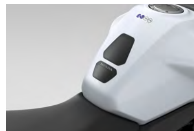
TANK PAD 08P70-MGC-JQ0

The skid pad, featuring the Honda logo, reduces damage of the fairing in case of a fall.