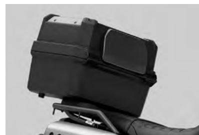
TOP BOX BACKREST 08F00-MJP-G50

Made of a sturdy and lightweight ballistic nylon, this 14L saddle bag enhances the tough appearance of the bike. It can be attached / detached in one step thanks to its three-point adapter sold separately. Equipped with a water-proof inner bag, easy to carry with its handle or its shoulder strap, this practical saddle bag is a must have for every day use. Allowable cargo load: 3.0 kg. Required support sold separately.