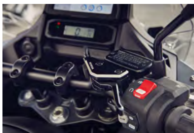
PARKING LEVER 08F70-MKT-D00

Only applicable to manual transmission versions of the NT1100, the quick shifter enables smooth but instantaneous clutchless gear shifts, both up and down. For an increased comfort and added sportiness of the riding experience.