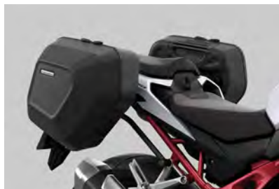
SIDE BAG 08ESY-MLB-SDB

Set of semi-rigid side bags (resin-made) Honda branded and specifically designed to suit the bike's shape, with waterproof inner bags and padlocks included. The bags have a 16.5L carrying capacity each and feature quick-release fasteners for easy attachment and detachment. Material / finishing: Textured Resin & Polyester, finished in Black. Maximum load capacity per panniers: 1.4 kg. Side Bags attachment included 08L74-MLB-D00.