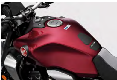
TANK PAD (CB LOGO) 08P71-MKN-D50

Add some protection and an extra touch of class to your CB1000R with this beautiful clutch cover.