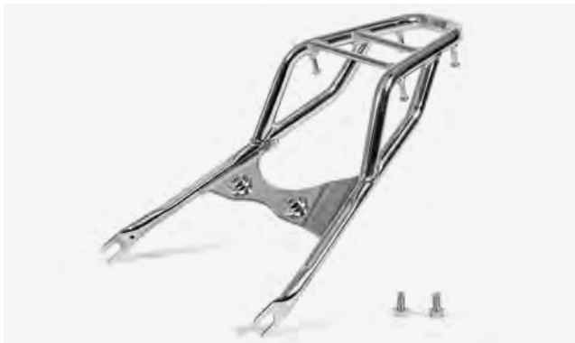
REAR CARRIER 08L70-K0F-D11