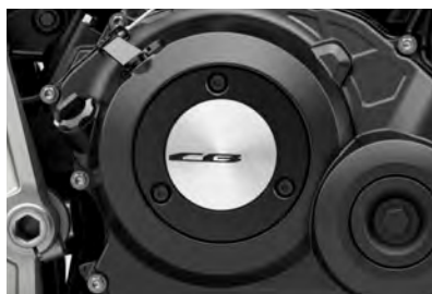
CLUTCH COVER 08Z71-MKJ-E50