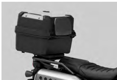
38L TOP BOX 08ESY-MLP-TB38