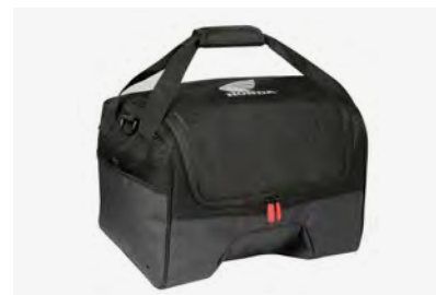
INNER BAG FOR 38L TOP BOX 08L75-MJP-G51